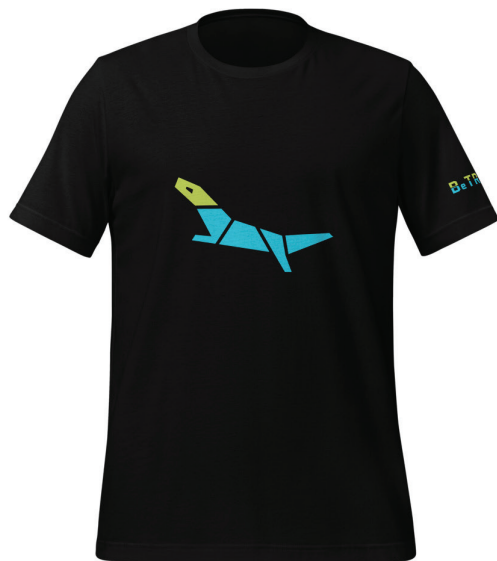
BeTriton T. Black and white colours. This Unisex Staple T-Shirt feels soft and light with just the right amount of stretch. Sizes: XS, S, M, L, XL, 2XL, 3XL, 4XL, 5XL