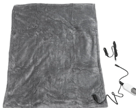
Heated blanket. Plugs into the BeTriton's 12V socket. 48W, soft warm flannel, 100 x 75 cm. Perfect for cold camping nights.