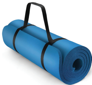
Custom shape sleeping mat. It's pre-cut to fit BeTriton's floor. 190 x 97 x 1.5 cm