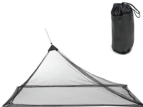
Mosquito net / shade. Works with mid and top spec of BeTriton eTrailer. Attaches to the roof. Has a zipper on both side for easy access