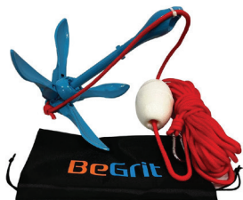
Folding anchor with rope and pouch. Perfect for parking BeTriton on water and staying overnight.