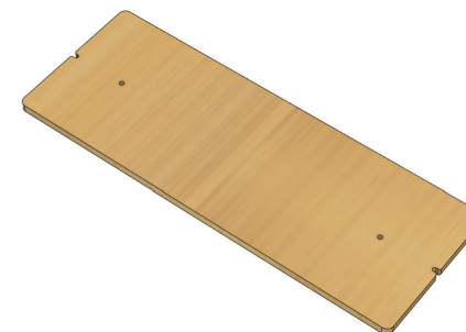
Table top. Works only if you have ordered two BeTriton seats as this table top attaches between the two seats.