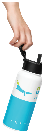
Stainless steel water bottle with a straw lid. This roomy 32 oz (950 ml) water bottle is ideal for long days and active lifestyles. The wide-mouth foldable straw ensures spill-free drinking while on the go, while the rotating handle makes it easy to carry.