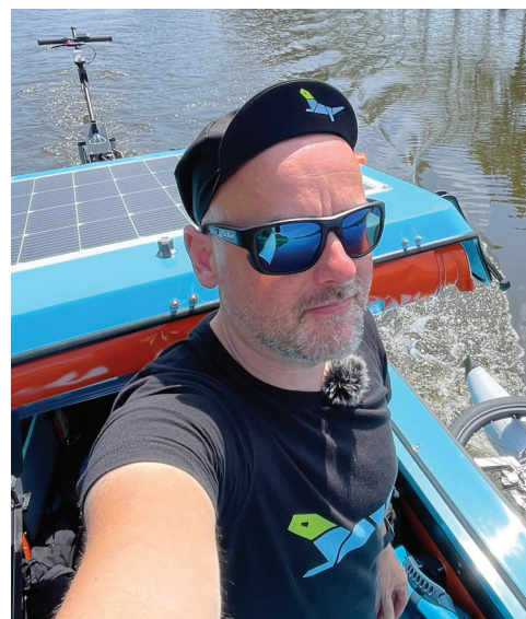
BeTriton cycle cap. Hand-crafted by a designer in Latvia. Sizes S, M, L.